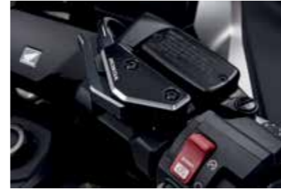
PARKING LEVER COVER 08F72-MKT-000

With its black anodized treatment and the inclusion of the Honda logo, this Aluminum Parking Lever Cover elevates your bike's aesthetics, adding an exclusive and stylish touch to its design.