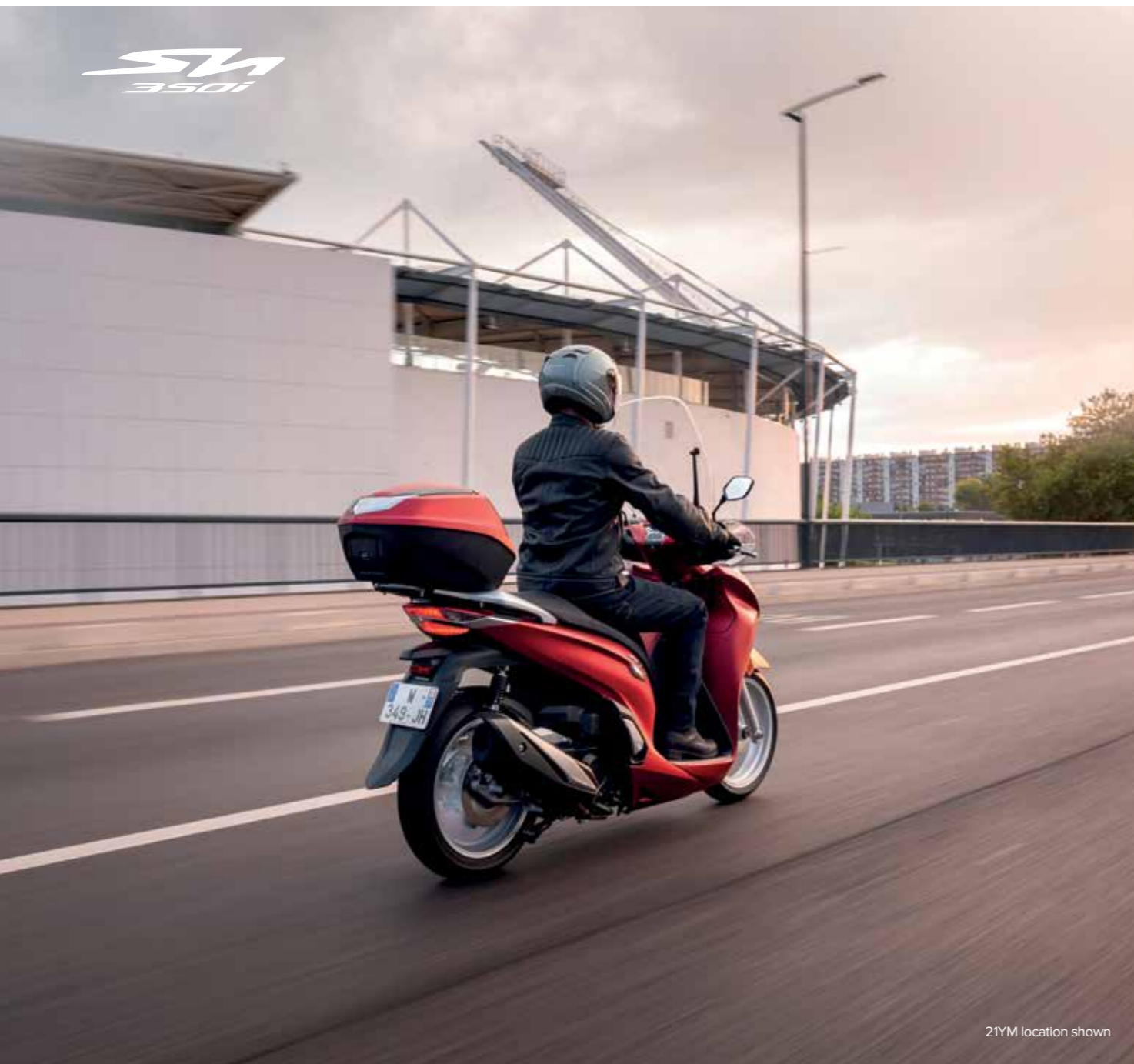
21YM location shown