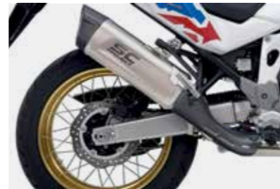
SC-PROJECT ADVENTURE MUFFLER 0R24M-REX-014

The Africa Twin SC-Project Adventure slip-on muffler offers a step up in the riding experience and performance, improving the exhaust sound and highlighting the sporty side of the bike.