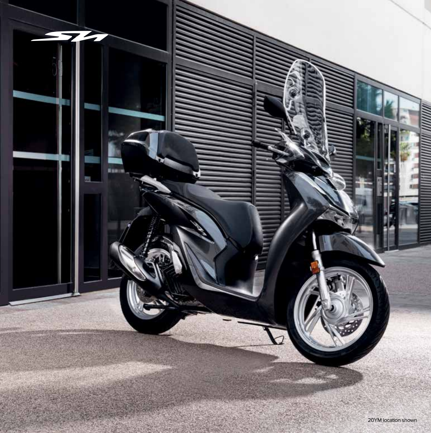
20YM location shown