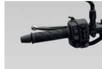
GRIP HEATER 08T70-MLB-D00

Extremely slim heated grips controlled by a simple operation of the integrated handle switch and displayed on the bike's TFT screen. Features 5 variable heating levels, integrated circuit to protect the battery from draining and memory function.