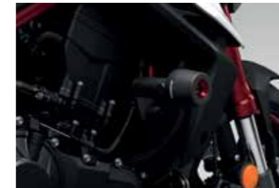
SKID PAD 08P70-MLB-D00

The skid pad, featuring the Honda logo, reduces damage of the fairing in case of a fall.