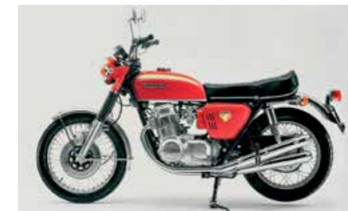
The Dream CB750 FOUR, which hit the market in July 1969

After 5 consecutive titles in the World Grand Prix Road Racing Series, Honda decided to withdraw and turn toward its primary target: transfer the technology obtained in competition to develop high-performance consumer machines. After a first attempt with a 450cc, Honda released the CB750 Four in January 1969. The initial production forecast of 1,500 units a year became soon a monthly figure and then jumped to 3,000 units/month. By pushing the boundaries of performance, reliability and easy handling in motorcycles, Honda created a new class of Superbikes. The CB1000R is the modern expression of the same spirit that guides Honda engineers since decades.