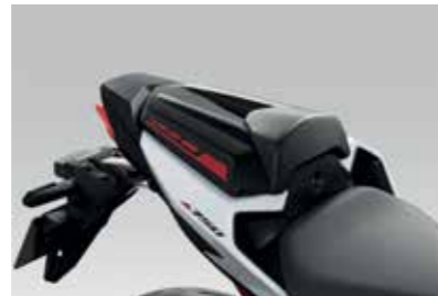
SEAT COWL 08F70-MLB-D00ZA / 08F70-MLB-D00ZB

Two-tone PVC leather and red double stitched rider seat, featuring the Honda logo, designed to enhance the sense of luxury.