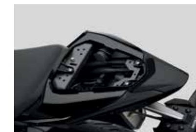
12V ACCESSORY SOCKET

The Grip Heater is a slim handlebar accessory providing 360° efficient heating for the rider's hands in cold weather. It features adjustable heat levels, smart heat allocation, and integrates seamlessly with the bike's design. Attachment is included in this Easy Kit.