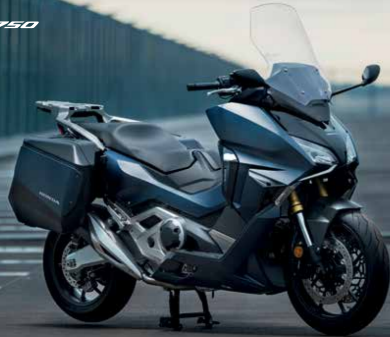
21YM location shown