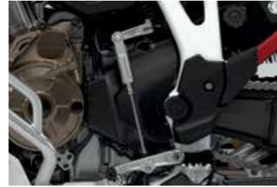
QUICK SHIFTER 08U70-MLG-E00

This kit enables the rider to change gear in the traditional 1 down – 5 up format by using the left foot. It works alongside the handlebar shift triggers giving the rider the choice of using either of them at any moment. (For DCT Version only)