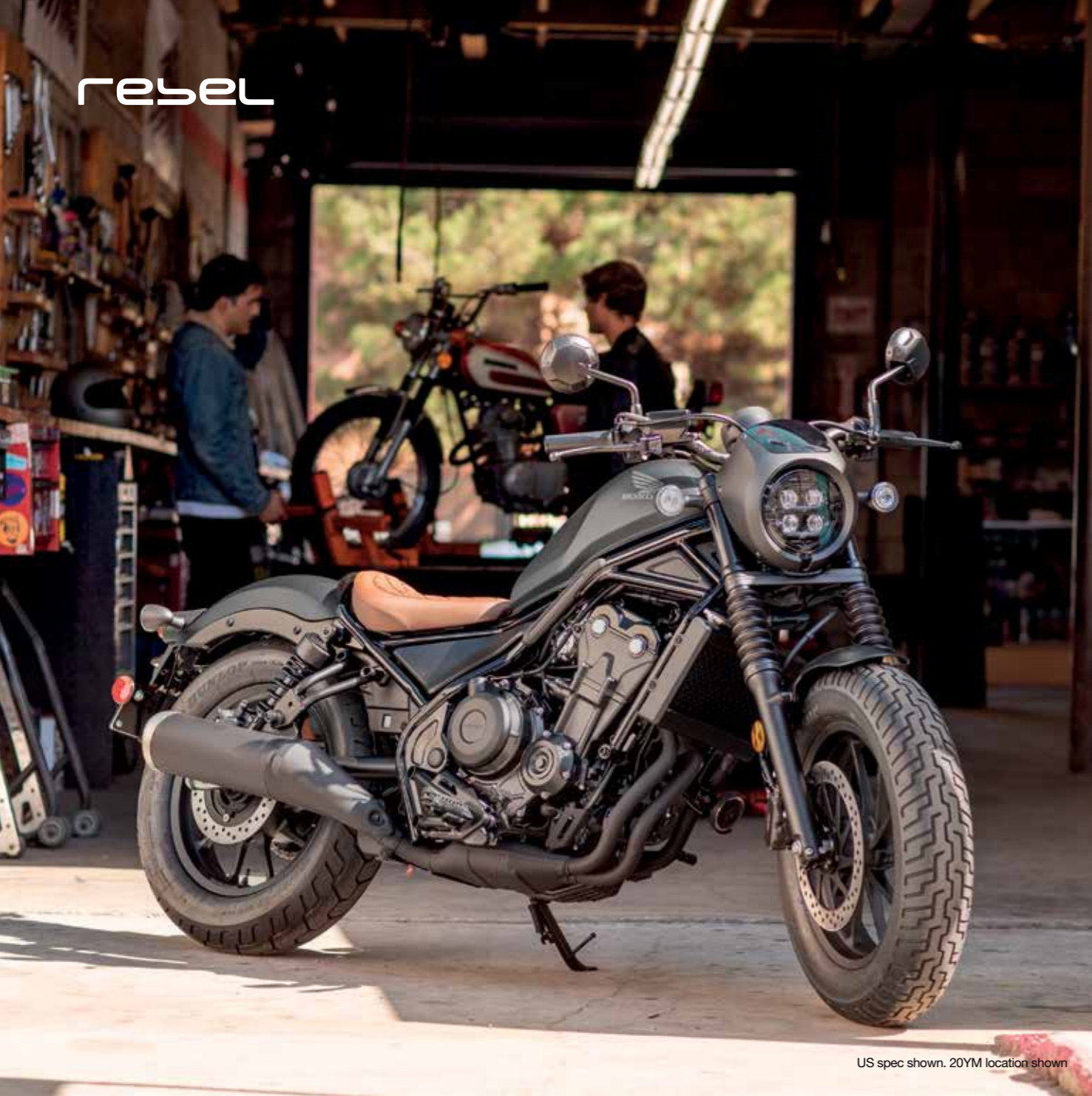
US spec shown. 20YM location shown