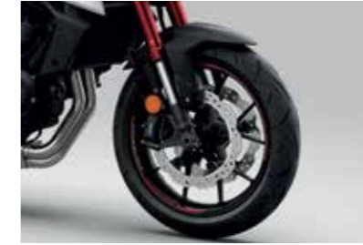
WHEEL STRIPES 08F73-MLB-D00ZA / 08F73-MLB-D00ZB

Foot pegs made of aluminium and finished in gloss black, polished aluminium details and featuring the Honda logo, enhancing the Premium feel of the Hornet.