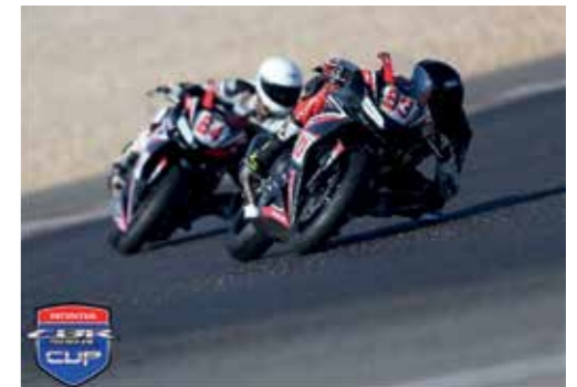
The CBR500R Cup.

It's not rare to find some CB500 proudly boasting more than 300,000 kms (more than 186,000 miles), but the long-time favourite of the couriers and the driving school is much more than a workhorse. Beginning in France in 1996, the CB500 Cup spread across Europe quickly. Since 2014, it is on a CBR500R that young talents try to make a name by themselves, on a budget. Sebastien Charpentier or James Toseland, to name a few, started there.