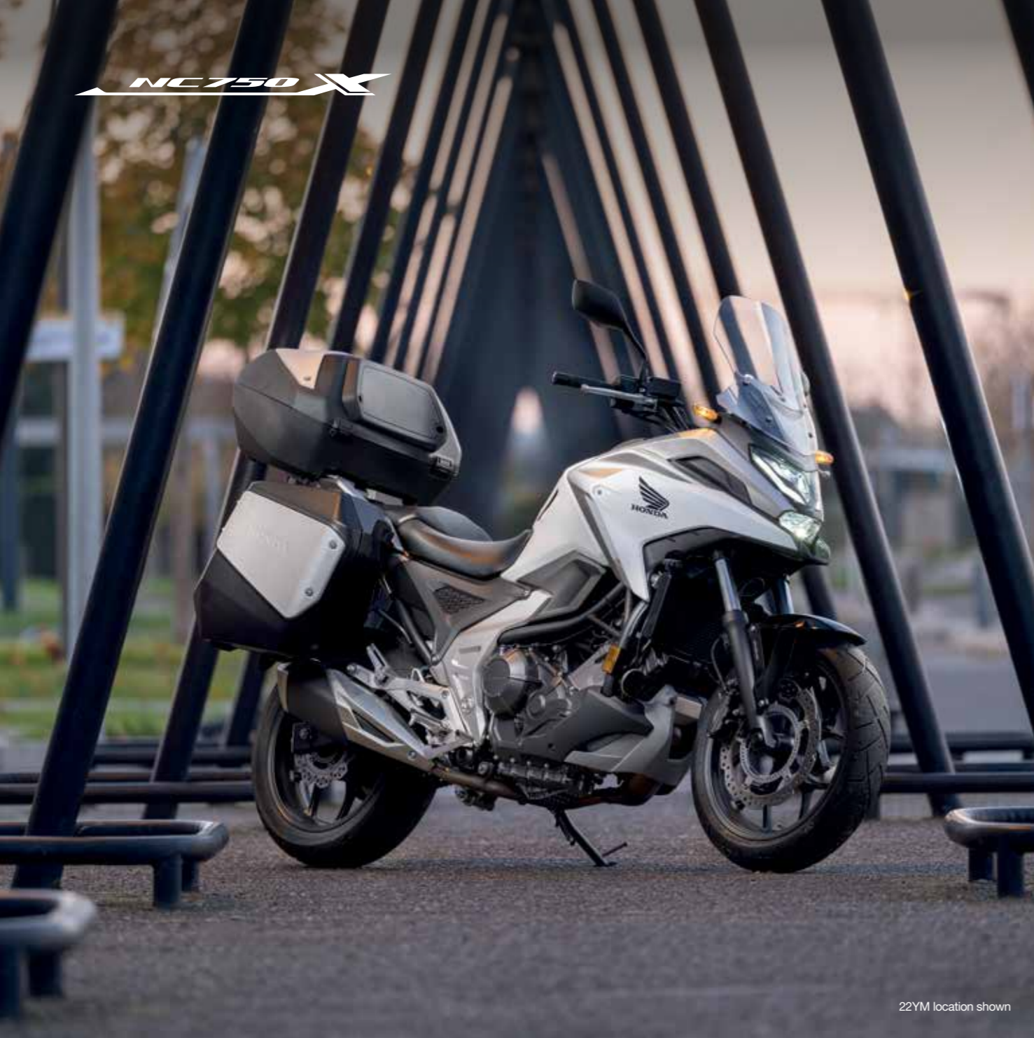
22YM location shown