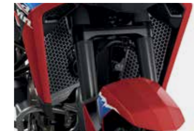
RADIATOR GRILLS 08F71-MKS-E00

The Engine Guard improves the protection of the engine and the lower part of the bike. Made of stainless steel and finished with electrolytic polishing, it is resistant to corrosion and easy to clean. (Attachment included)