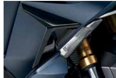
LOWER DEFLECTOR 08R71-MKV-000

Featuring the FORZA logo, the Upper Deflectors set improves comfort by reducing the airflow around the rider's waist.