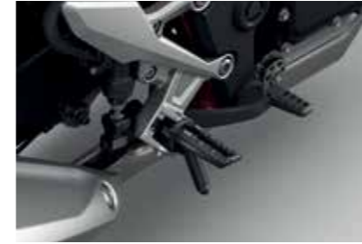
RIDER STEPS 08R71-MLB-D00

Give the CB750 a sportier look with these Grip Ends, featuring the Honda logo, while providing additional protection in case of fall.