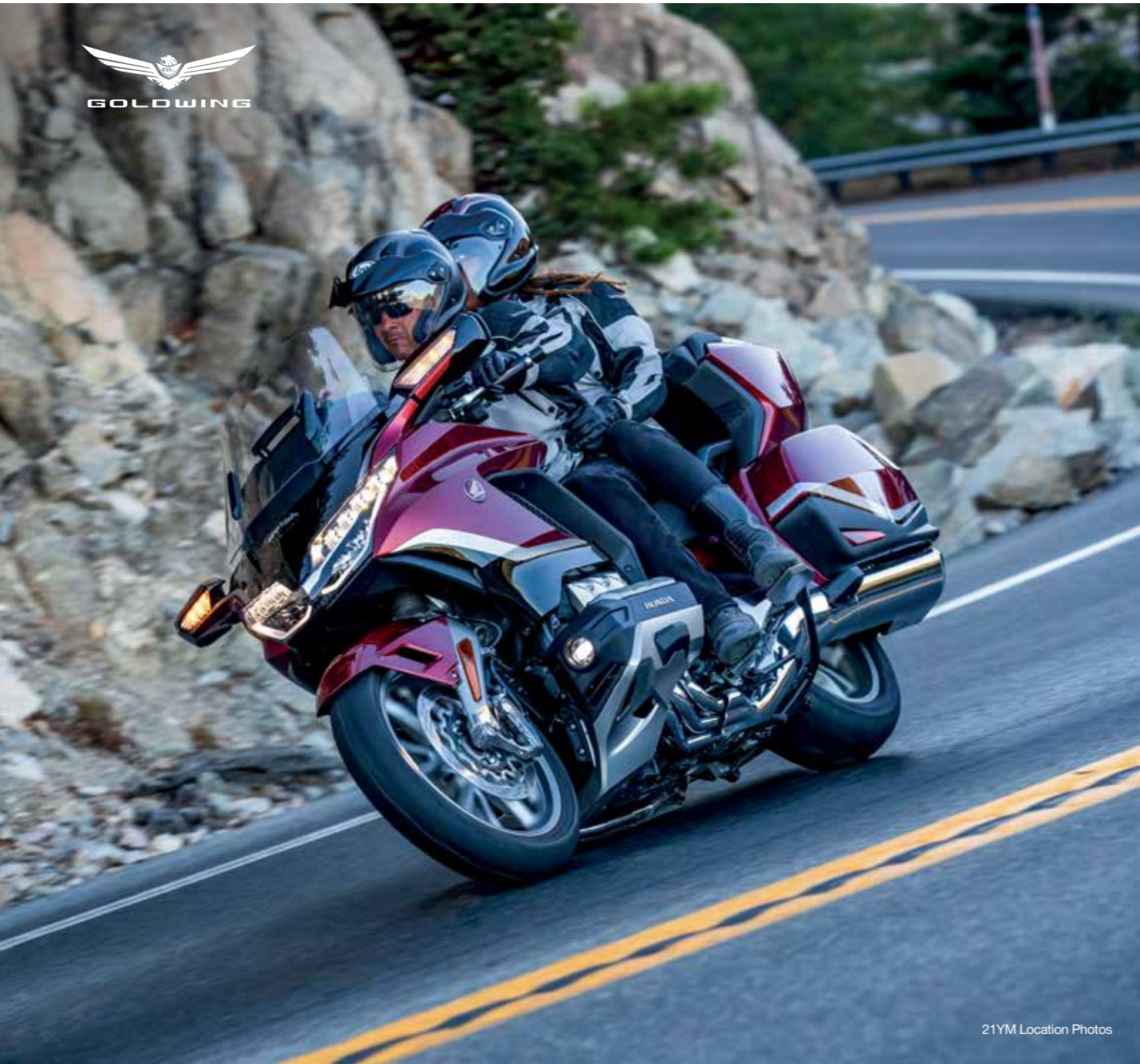
21YM Location Photos