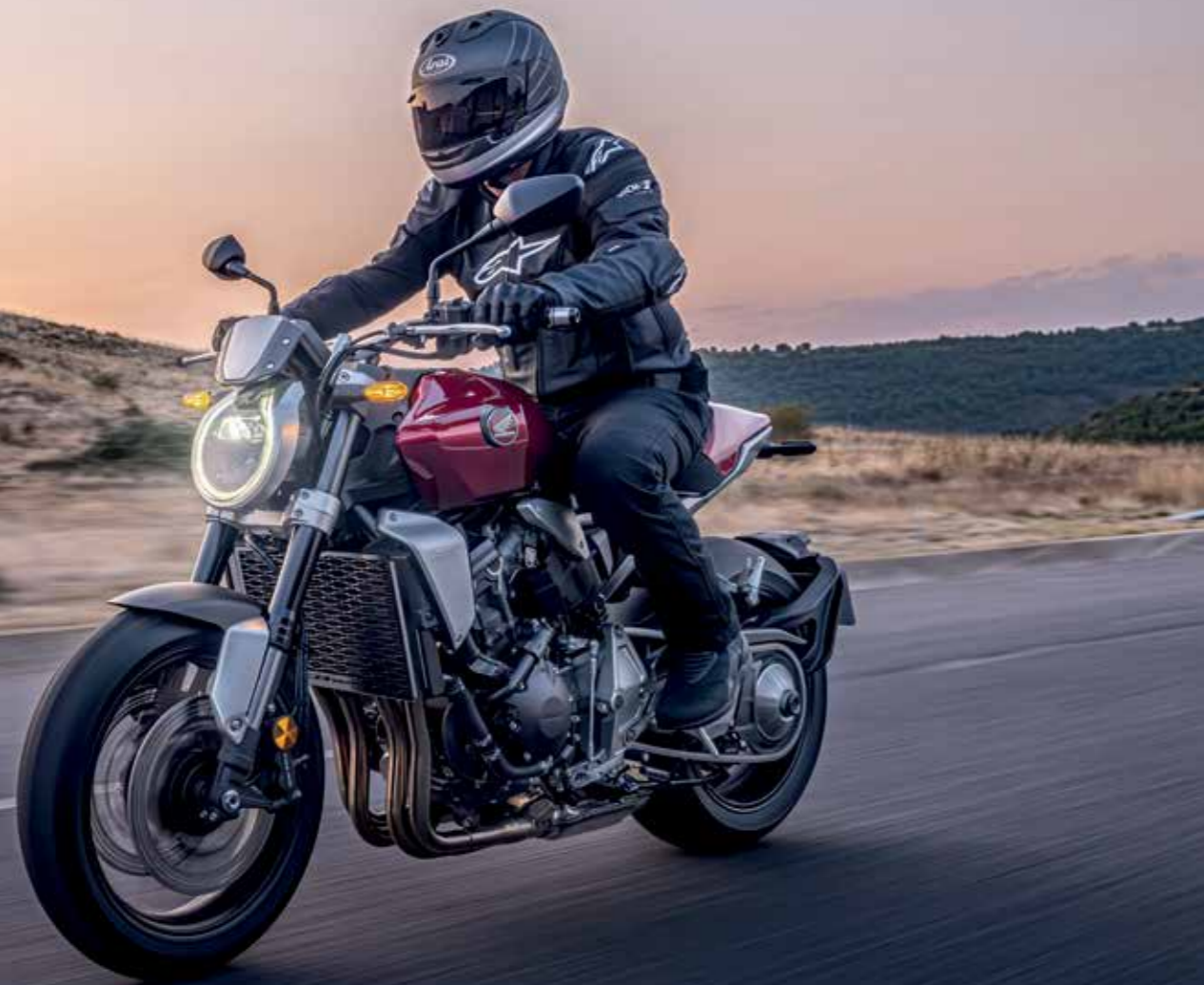
21YM location shown