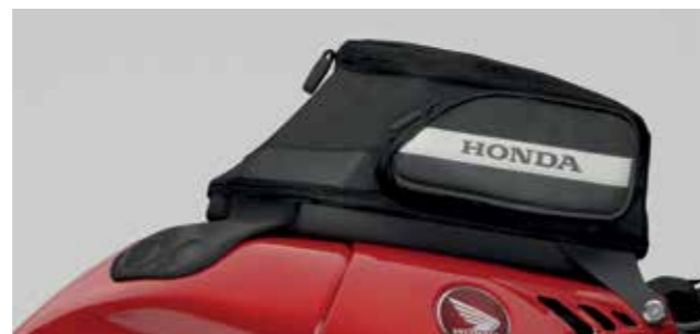
TANK BAG 08L71-MKR-D10

This Tank Bag can be swiftly attached or removed and will remain firmly secured with its fasteners on the front. Its Honda Genuine design perfectly matches the tank shape to provide a 7 litres capacity without impairing the handling of the Fireblade RR-R. Clear pocket on the top with a slit to route a cable if need be. Zipped pockets on each side, carrying handle and rain cover achieve to make this tank bag the ideal luggage for your Fireblade RR-R.