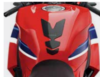
TANK PAD 08P82-MKR-D10

This rubber-made pad is exclusively designed to fit the tank shape and to protect it from scratches.