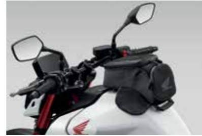
3L TANK BAG 08L89-MKS-E00

A simple and functional rear bag specifically adapted to the tapered shape of the rear seat. Easy attachment and stable mounting is possible when installed with the rear seat bag attachment, and a rain cover is included for added practicality. Bag capacity is of 15L, which can be expanded to 22L. Rear Seat Bag Attachment 08L70-MKP-T00 and Protective Film 08P71-MLB-D00 included with the kit.