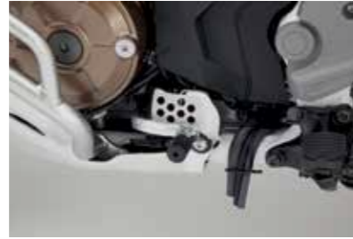
DCT PEDAL SHIFT 08U70-MKS-E50

With their aggressive spike shape and a surface 57% larger than the standard ones, these Rally Steps improve the stability and control during off-road riding while reduce risk of boot slip.