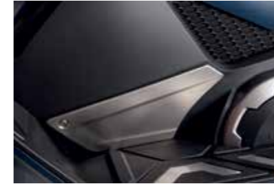
LATERAL COVERS 08F71-MKV-000

With the same black anodized treatment as the cover, this Aluminium Parking Lever adds a design and sophistication touch to the cockpit of the motorcycle.