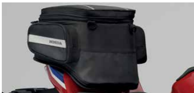
REAR SEAT BAG 08L72-MKR-D10

This Rear Seat Bag has an adjustable capacity of 15 to 22 litres. It features convenient zipped pockets on each side and a carrying handle. A waterproof inside liner and a rain cover protect your personal items from the elements. Replacing the pillion seat, its base with fasteners keep the bag perfectly attached yet easy to remove, without the hassle of straps or tools.