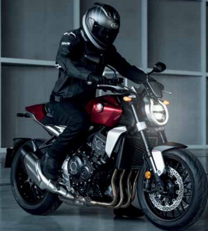
21YM location shown