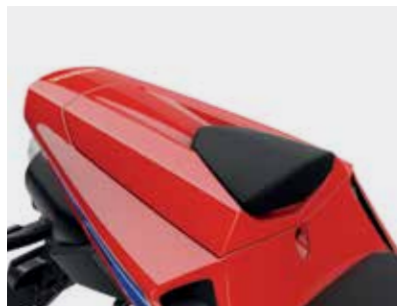
SEAT COWL 08F70-MJC-N30ZA / 08F72-MJC-N40ZA

This stylish Single Seat Cowl replaces the pillion seat with an easy operation, creating a strong resemblance to the racing machine and reducing the weight. It cannot be used in conjunction with the Seat Bag.