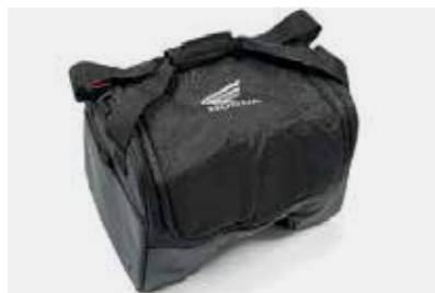
INNER BAG FOR 38L TOP BOX 08L75-MJP-G51

Black nylon bag with embroidered silver Honda wing logo on the top and red zippers. Comes with adjustable shoulder belt and carrying handle.