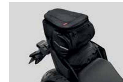
REAR SEAT BAG

Dimensions in mm (W x L x H): 178 x 285 x 130