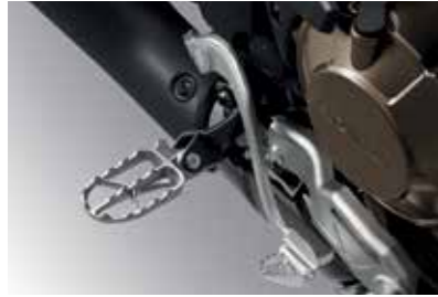
RALLY STEPS SET 08R79-MKS-E00

With their aggressive spike shape and a surface 57% larger than the standard ones, these Rally Steps improve the stability and control during off-road riding while reduce risk of boot slip.