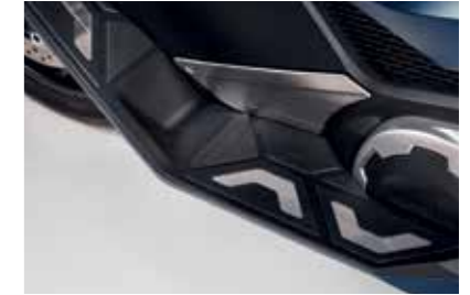
FLOOR PANEL 08P70-MKV-000

Stainless steel covers protecting the body parts from kick damages and improving the quality feel of your bike.