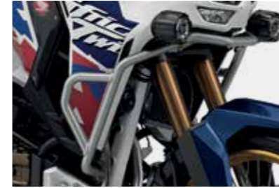
FRONT SIDE PIPE WITH ATTACHMENT 08ESY-MLN-FSPAS

The stainless piping of the Front Side Pipe has been finished with electrolytic polishing, making it resistant to corrosion and allowing dirt and debris to be easily cleaned. Fairings and other parts damage in case of fall is reduced, while further enhancing the tough, adventure image.