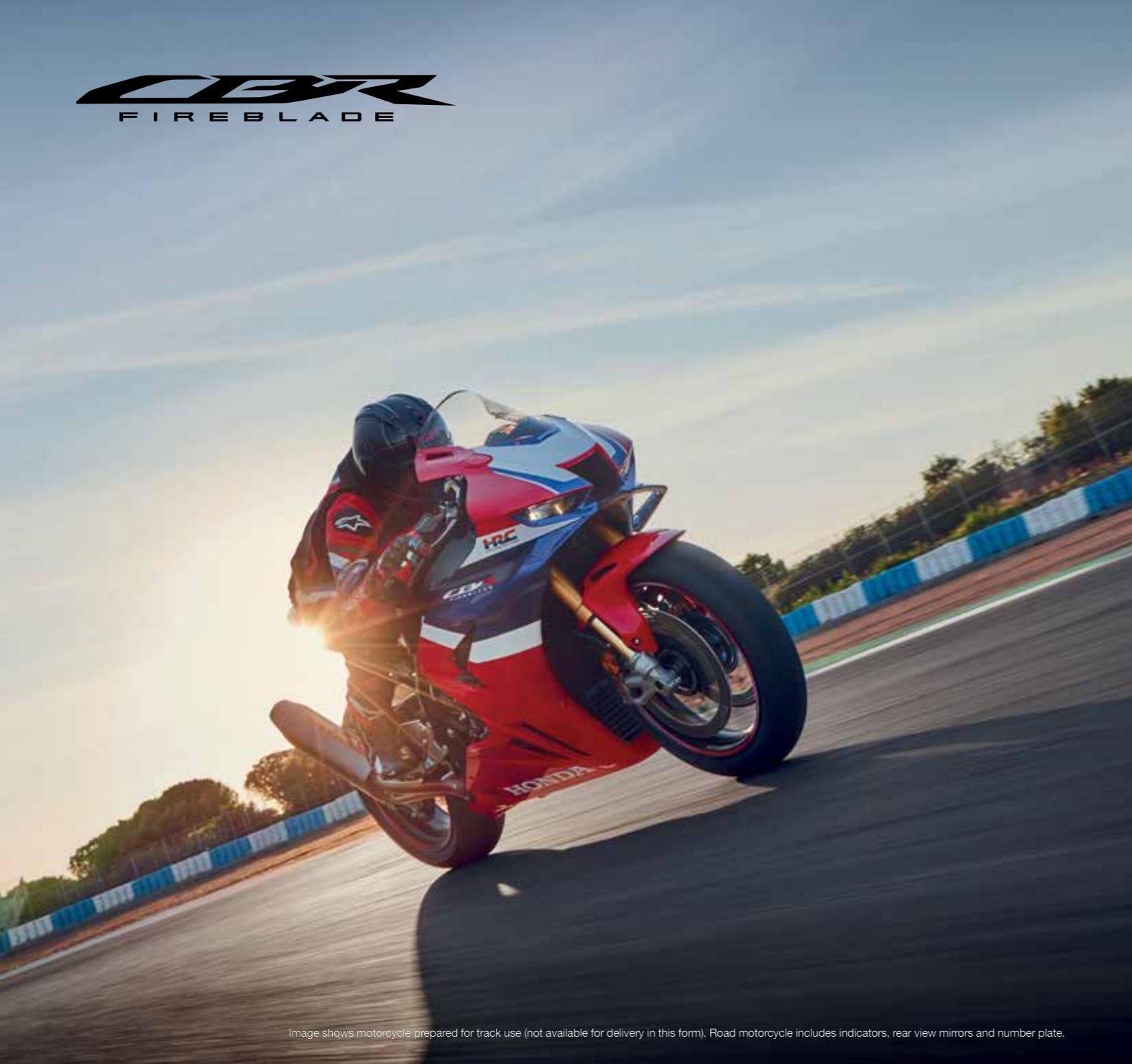
Image shows motorcycle prepared for track use (not available for delivery in this form). Road motorcycle includes indicators, rear view mirrors and number plate.