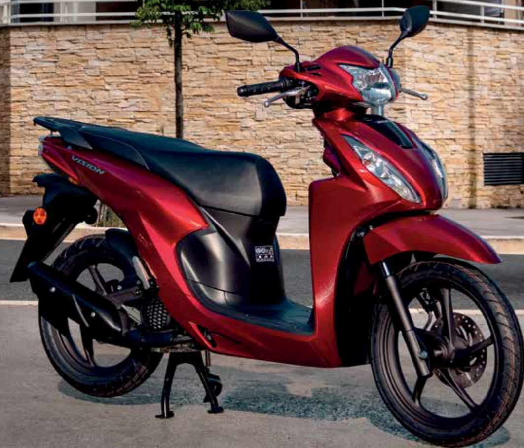
Action photos show 21YM