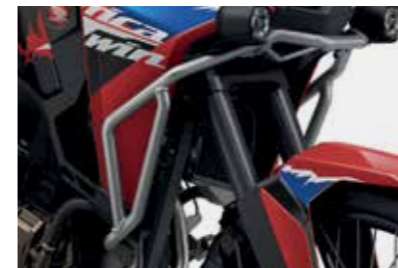
FRONT SIDE PIPE WITH ATTACHMENT 08ESY-MLN-FSP

The stainless piping of the Front Side Pipe has been finished with electrolytic polishing, making it resistant to corrosion and allowing dirt and debris to be easily cleaned. Fairings and other parts damage in case of fall is reduced, while further enhancing the tough, adventure image.