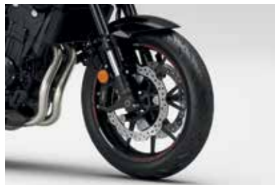
WHEEL STRIPES KIT 08F72-MKP-J40ZD / 08F72-MKP-J40ZE / 08F72-MKP-J40ZG / 08F72-MKP-J40ZH / 08F72-MKP-J40ZJ

Customize your bike effortlessly with this user-friendly wheel stripes kit (one kit per wheel).