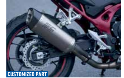
SC PROJECT SC1-R MUFFLER 0R24M-PEX-013

*Only for Hornet trademark registration area.