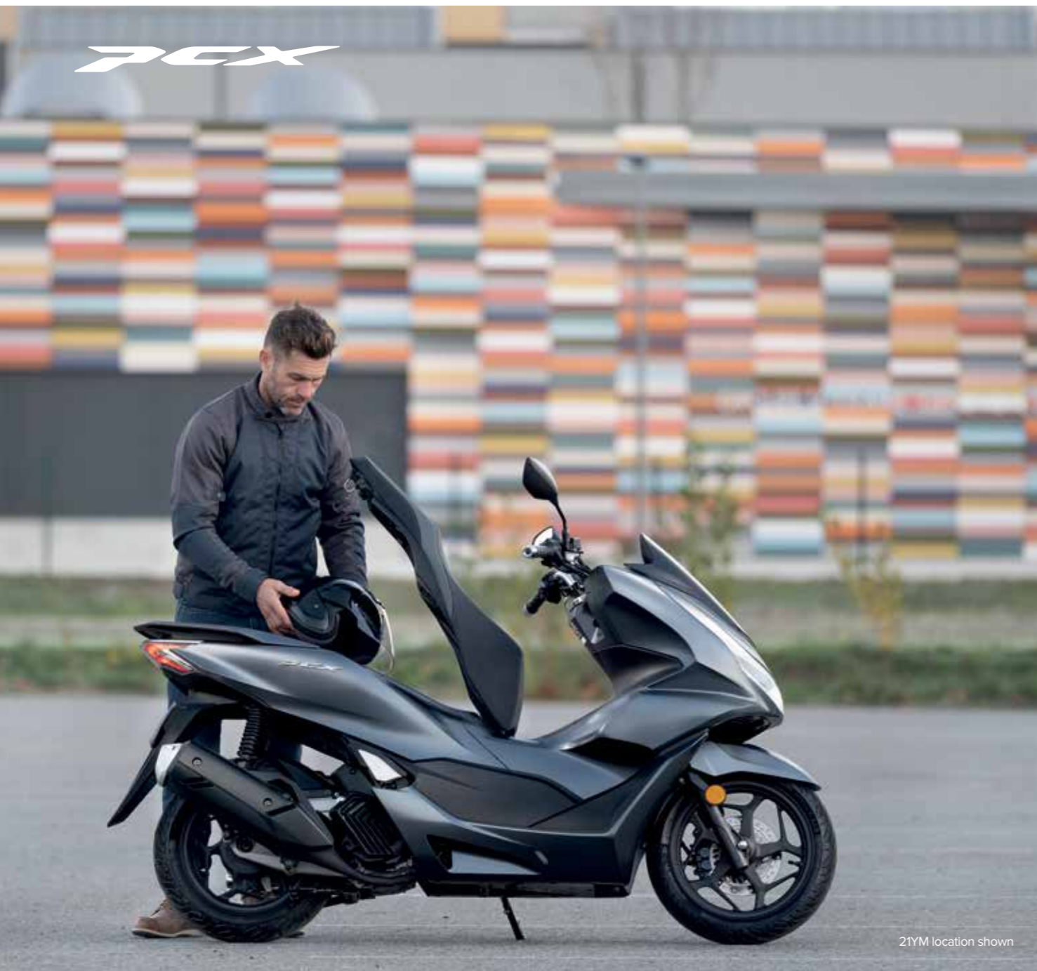
21YM location shown