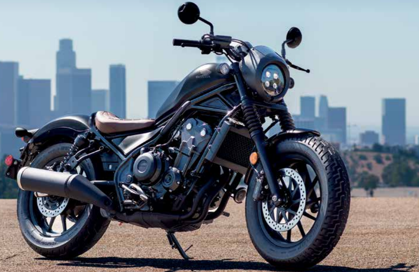
US spec shown. 20YM location shown