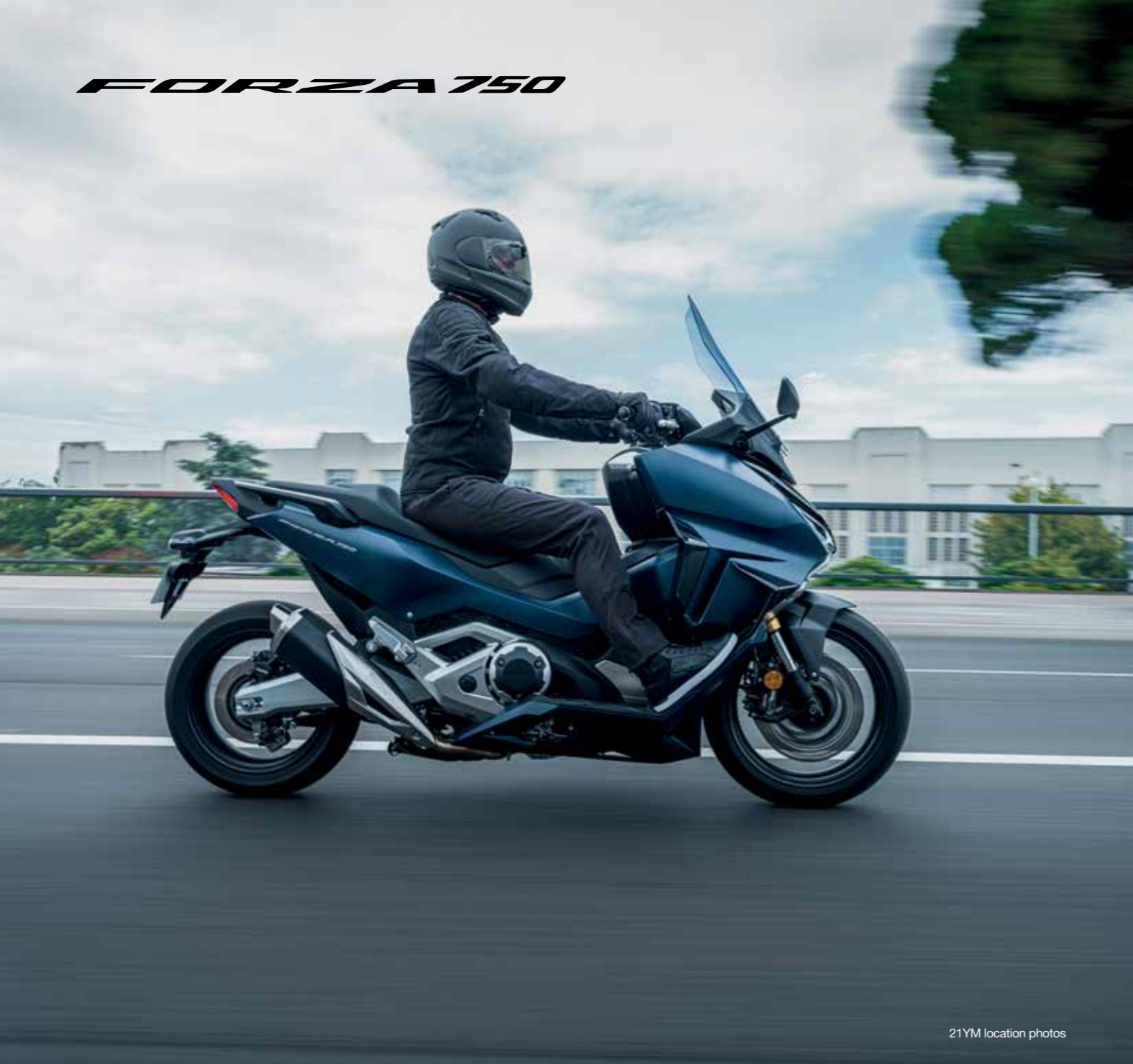
21YM location photos