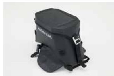
4.5L TANK BAG 08L85-MKS-E00

Black nylon bag with embroidered silver Honda wing logo on the top and red zippers. Comes with adjustable shoulder belt and carrying handle.