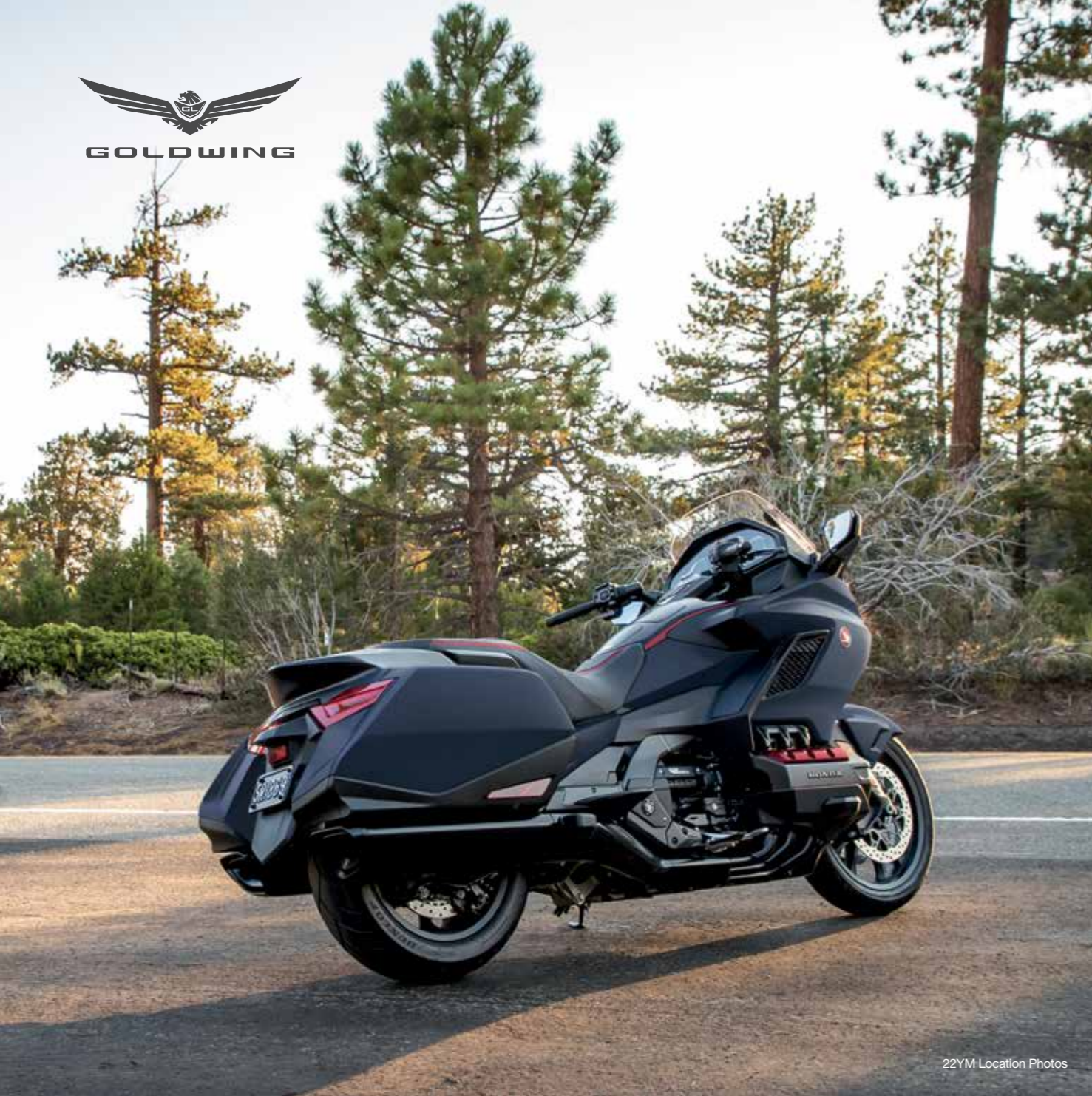
22YM Location Photos