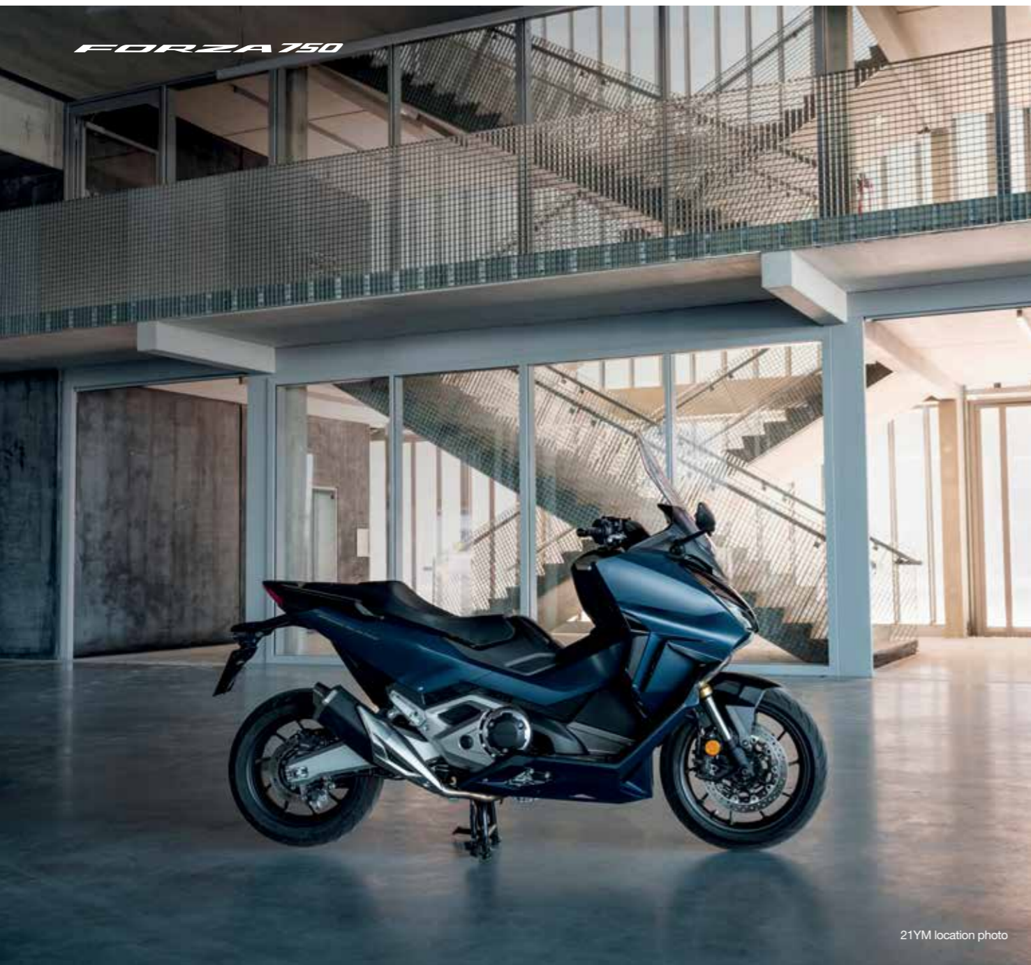
21YM location photo