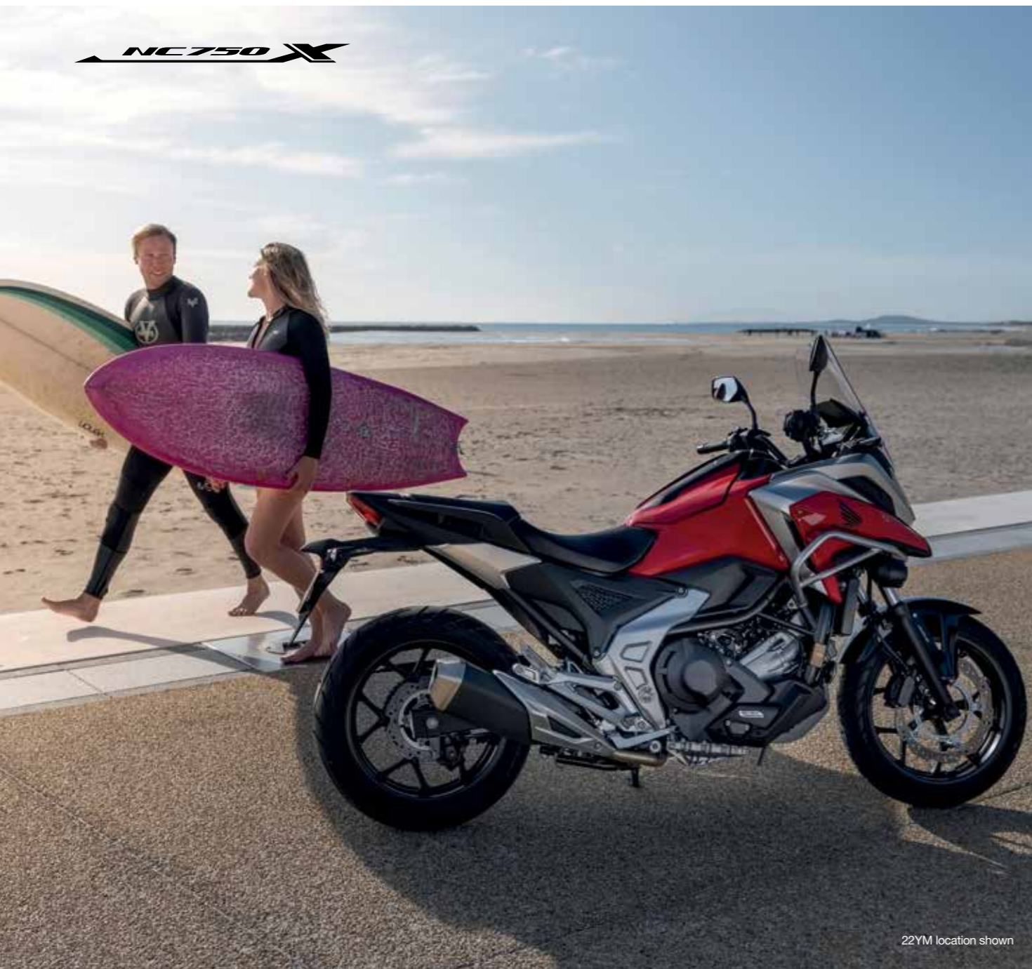
22YM location shown