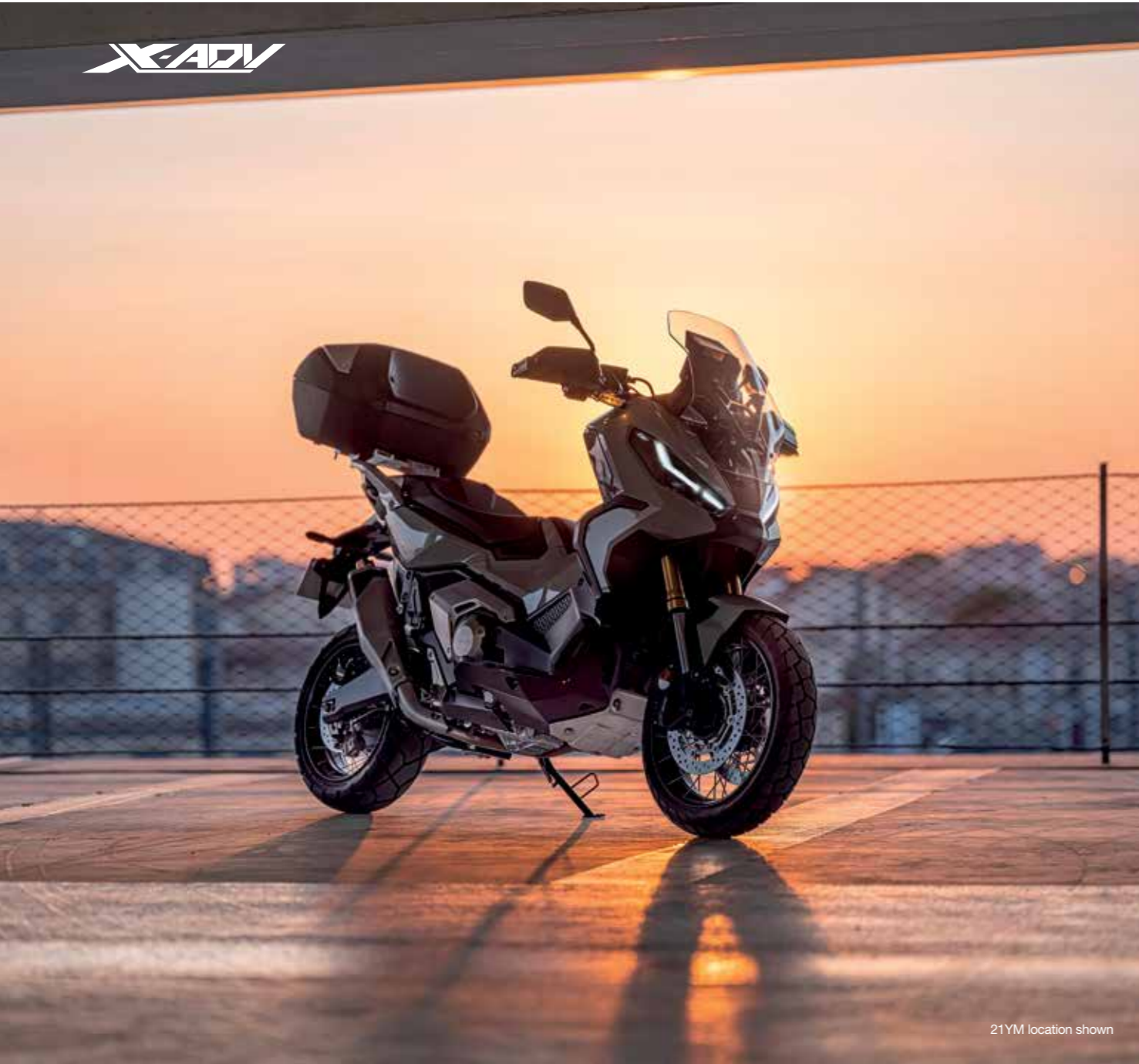
21YM location shown