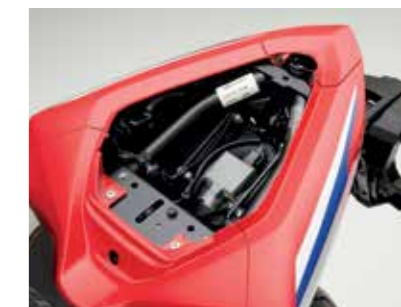
USB POWER SOCKET 08E72-MKR-D10

Made of luxury Alcantara material that provides outstanding soft feel and superb breathability, the Rider Special Seat improves the riding comfort. Protected with a water repellent finish, the beautiful matt texture of this seat and the CBR branding increase the premium feel of the Fireblade RR-R. Available only in Black / Grey with Red stitching.