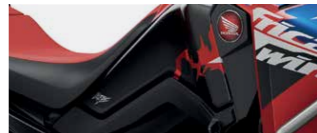
SIDE TANK PADS

Made of stainless steel and showcasing the CRF logo, the Radiator Grills increase the African Twin tough image. Their original mesh pattern combines cooling capabilities with protection for the radiators against flying debris.