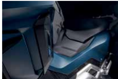
UPPER DEFLECTOR 08R72-MKV-000

With 5 heat levels adjustable through the handlebar switch and displayed on the TFT screen, the extremely slim heated grips warm up the rider's hands for maximum comfort. The heat level is memorized when the ignition is switched off and an integrated circuit prevents the battery from draining. Electricity consumption: 32W.