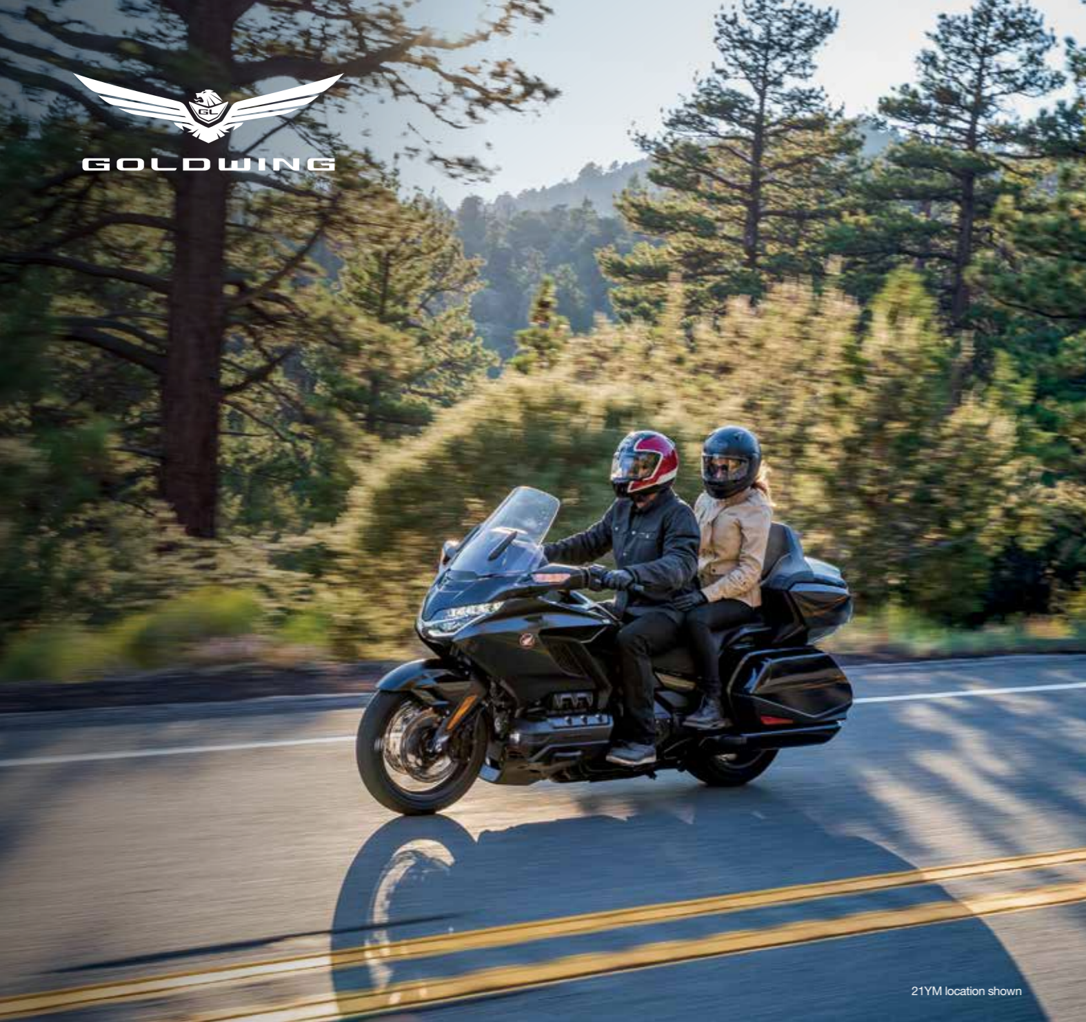
21YM location shown