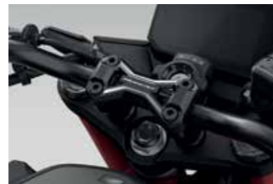
HANDLE HOLDER 08F71-MLB-D00

Precision-cut aluminium handlebar holder featuring the Hornet logo that provides additional high-quality appearance to the CB750 Hornet.