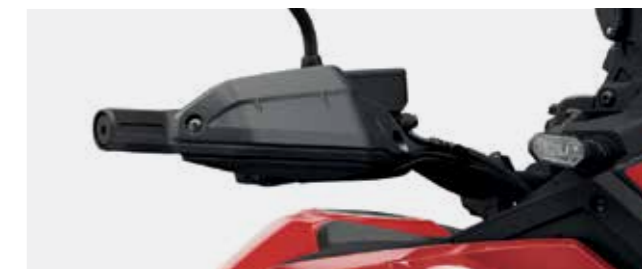
KNUCKLE GUARDS EXTENSION

08P72-MKS-E00ZB / 08P72-MKS-E00ZC / 08P72-MKS-E00ZD