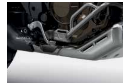
ENGINE GUARD WITH ATTACHMENT 08ESY-MKS-ENG

The Engine Guard improves the protection of the engine and the lower part of the bike. Made of stainless steel and finished with electrolytic polishing, it is resistant to corrosion and easy to clean. (Attachment included)