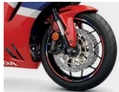
WHEEL STRIPE TRICOLOUR SET 08F70-MKZ-J30ZA

The Oil Filler Cap is expertly crafted from premium-grade aluminum, ensuring superior quality and precision. It features a vibrant red anodized finish that adds a striking visual element, while the laser-etched HRC logo on both sides of the handgrip enhances its aesthetics. The cap's interior is hollowed out to enhance strength and minimize weight. Additionally, the cap includes a wire-lock hole, commonly found on HRC works machines, making it suitable for circuit riding. With its surface treatment of red anodization, the Oil Filler Cap combines style, functionality, and a touch of racing heritage.