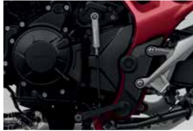
QUICK SHIFTER 08U70-MLB-D00

The Hornet's quick-shifter allows up and down clutchless gear changes, with auto blipper function for smooth and instant shifting which enables stress-free riding not only for sports driving but also for increased comfort.