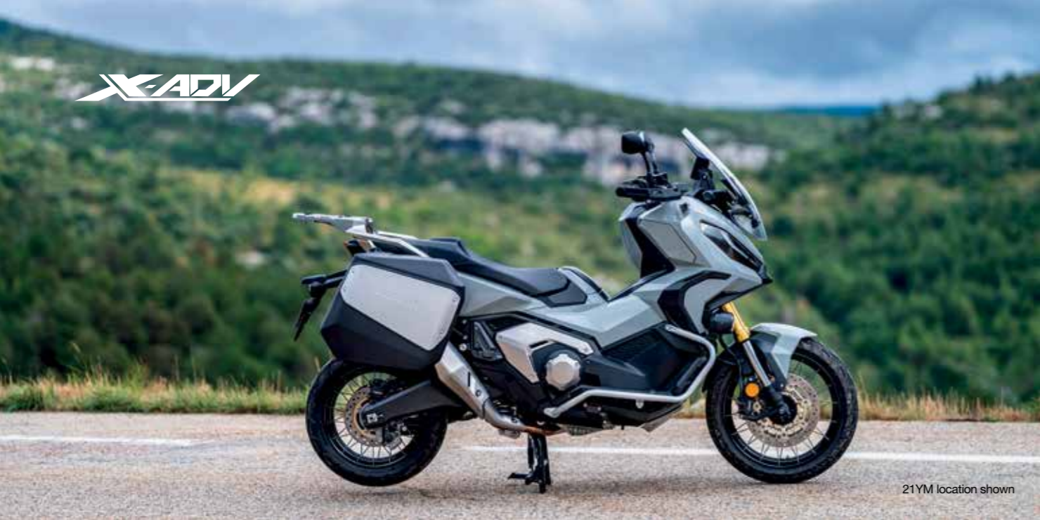
21YM location shown