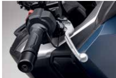
GRIP HEATERS 08T71-MKT-000

With 5 heat levels adjustable through the handlebar switch and displayed on the TFT screen, the extremely slim heated grips warm up the rider's hands for maximum comfort. The heat level is memorized when the ignition is switched off and an integrated circuit prevents the battery from draining. Electricity consumption: 32W.