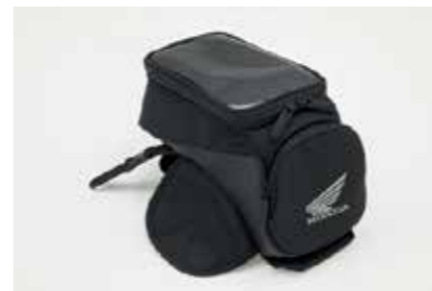
3L TANK BAG 08L89-MKS-E00

This light and compact Tank Bag features a transparent pocket and it's ideal to store small personal items. Unnoticeable while steering the bike, this Tank Bag is firmly attached thanks to a one-touch buckle and a magnet. A rain cover is included.