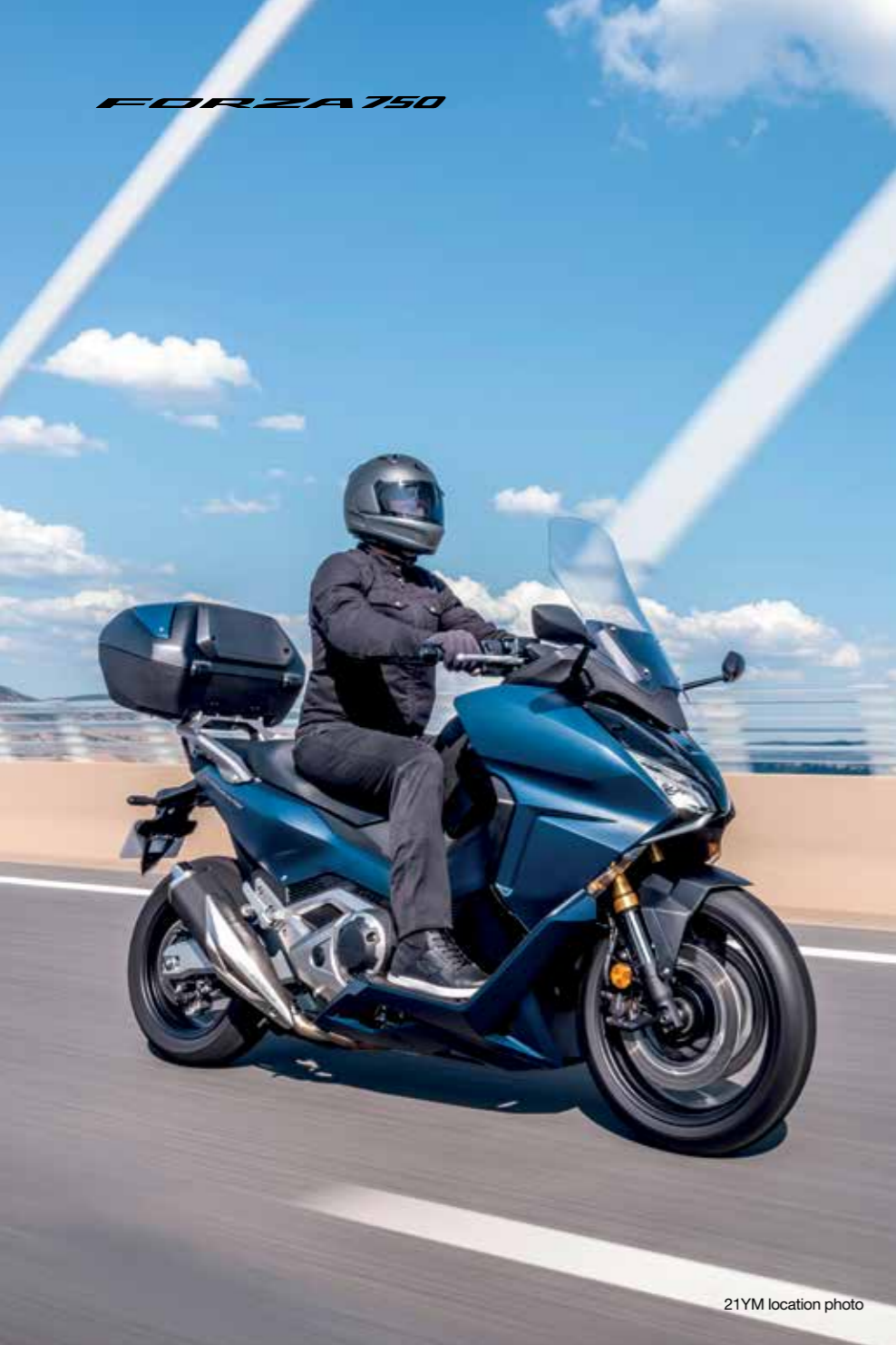
21YM location photo