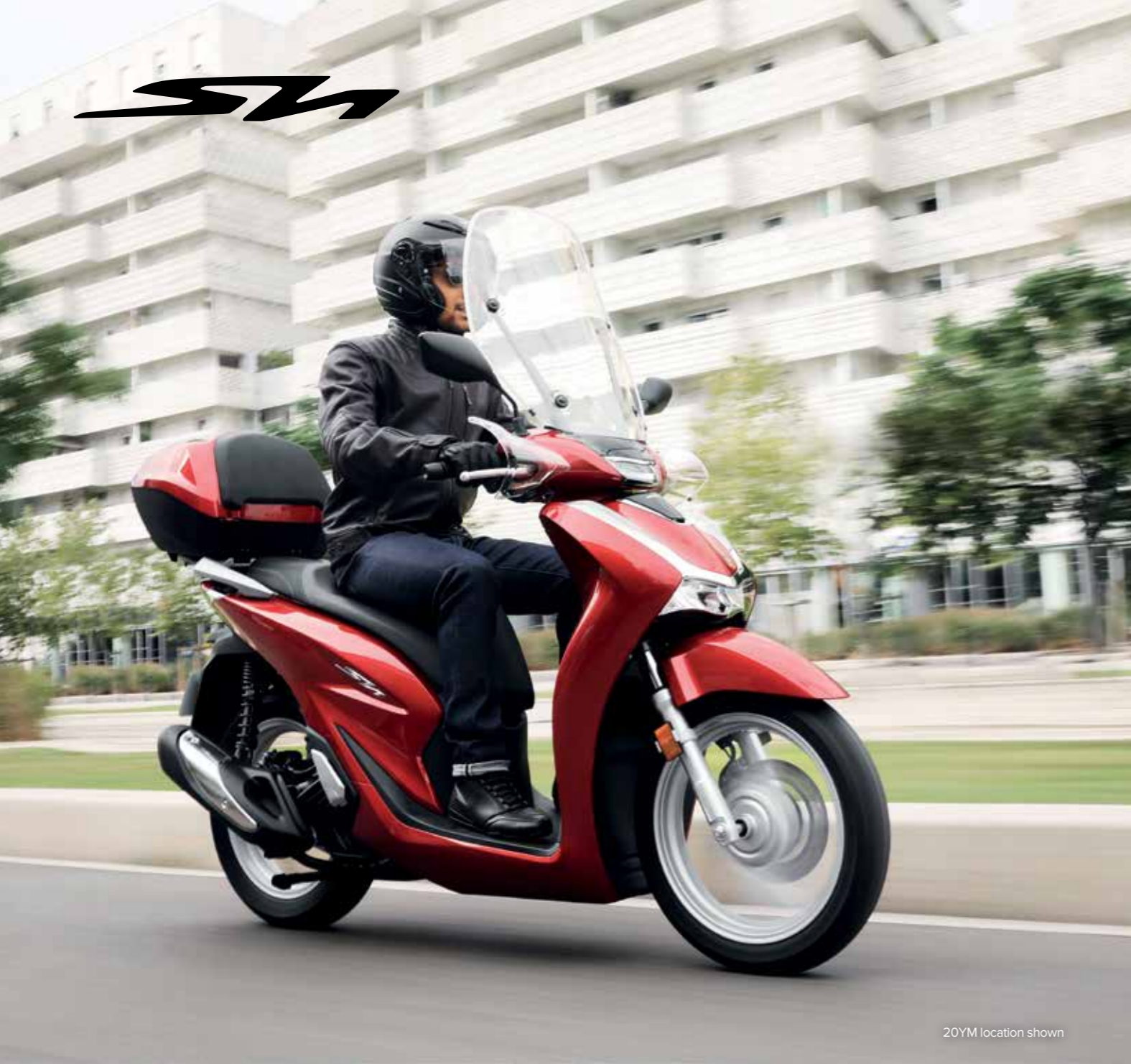
20YM location shown