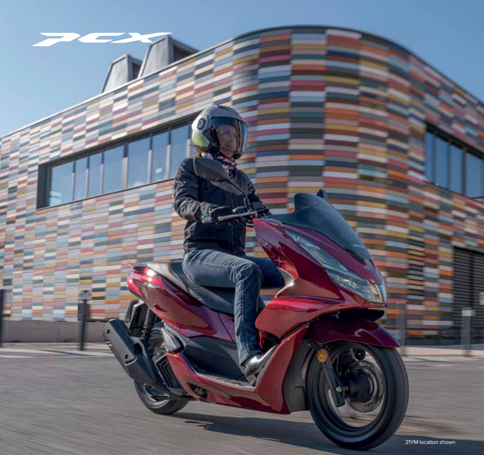
21YM location shown