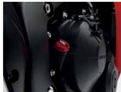
OIL FILLER CAP 08F72-MKZ-J30

The Oil Filler Cap is expertly crafted from premium-grade aluminum, ensuring superior quality and precision. It features a vibrant red anodized finish that adds a striking visual element, while the laser-etched HRC logo on both sides of the handgrip enhances its aesthetics. The cap's interior is hollowed out to enhance strength and minimize weight. Additionally, the cap includes a wire-lock hole, commonly found on HRC works machines, making it suitable for circuit riding. With its surface treatment of red anodization, the Oil Filler Cap combines style, functionality, and a touch of racing heritage.