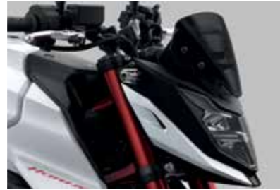
METER VISOR 08R70-MLB-D00

Features adjustable operation load in three stages.