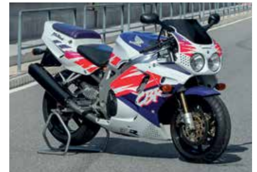
The CBR900RR Fireblade that started all.

More than 25 years after, the most powerful and nimble Honda bikes keep carrying the Blade legacy.