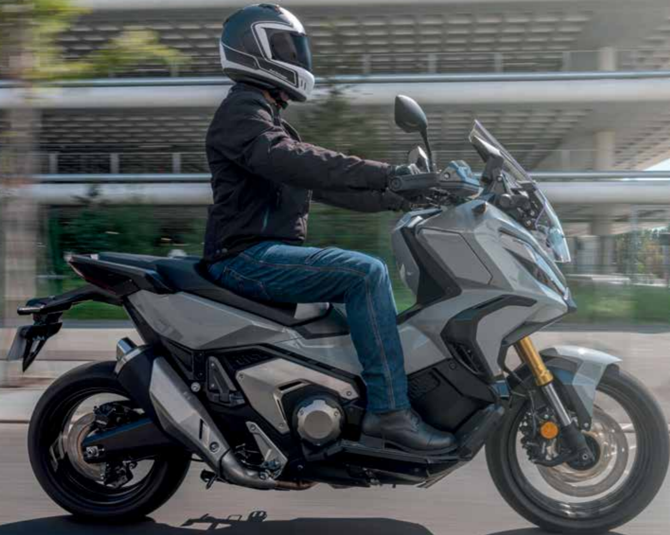
21YM location shown