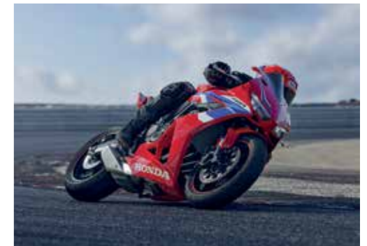
The CBR650R in action.

Since 1992 with the ST1100 aka "Pan European" model, Honda equips more and more of its motorcycles with a system called Honda Selectable Torque Control (HSTC). This system monitors constantly the speeds of the front and rear wheels via speed sensors incorporated into the Anti-Lock Braking System (ABS). When the rear wheel begins to rotate significantly faster than the front, the system reduces fuel delivery to the engine and limits rear-wheel slippage. In 2019 with the new CBR650R, Honda applied this technology for the first time to its mid-displacement SuperSport motorcycle. The rider can deactivate it on demand.