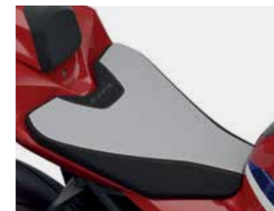
RIDER SPECIAL SEAT (ALCANTARA) 08R72-MKR-D10

Made of luxury Alcantara material that provides outstanding soft feel and superb breathability, the Rider Special Seat improves the riding comfort. Protected with a water repellent finish, the beautiful matt texture of this seat and the CBR branding increase the premium feel of the Fireblade RR-R. Available only in Black / Grey with Red stitching.