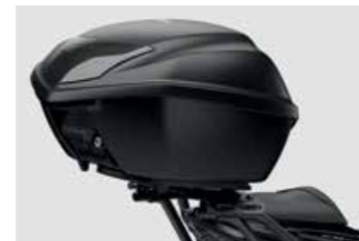
35L TOP BOX KIT