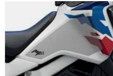
SIDE TANK PADS 08F71-MLN-EQ0ZA / 08R75-MKS-E20

The Engine Guard improves the protection of the engine and the lower part of the bike. Made of stainless steel and finished with electrolytic polishing, it is resistant to corrosion and easy to clean. (attachment included)