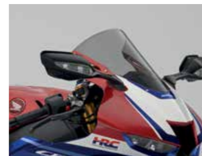
HIGH WIND SCREEN 08R70-MKR-D10ZA / 08R71-MKR-D10ZA

Developed after wind-tunnel and real-life riding sessions, the High Wind Screen combines increased wind protection and improved motorcycle control. Compared to the standard version, the top of the wind screen is 8mm higher and 40mm further forward. Furthermore, as a Genuine Honda design, it is fully WVTA certified. 2 versions available: