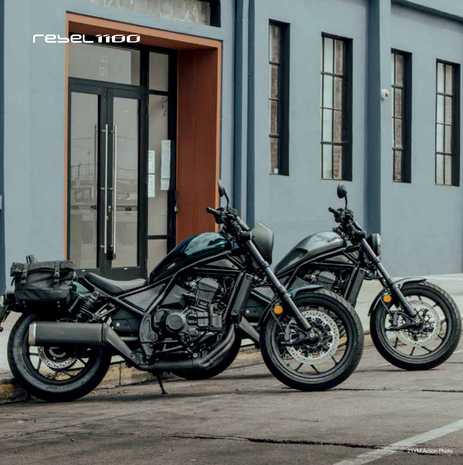
21YM Action Photo