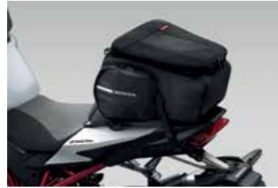
REAR SEAT BAG 08ESY-MLB-RRSEAT

Set of semi-rigid side bags (resin-made) Honda branded and specifically designed to suit the bike's shape, with waterproof inner bags and padlocks included. The bags have a 16.5L carrying capacity each and feature quick-release fasteners for easy attachment and detachment. Material / finishing: Textured Resin & Polyester, finished in Black. Maximum load capacity per panniers: 1.4 kg. Side Bags attachment included 08L74-MLB-D00.