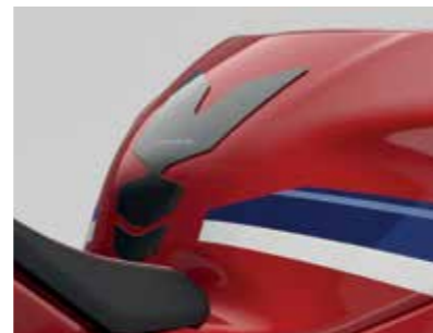
TANK PAD 08P82-MKR-D10

Preventing objects from getting caught in the sprocket, this heavy-duty cover will not impair the bend of the swingarm. Designed to conform to circuit regulations, it also increases the Racing appearance of the Fireblade RR-R.