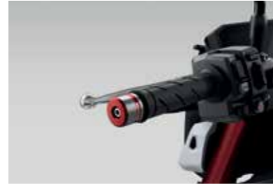
GRIP ENDS 08F72-MLB-D00

The meter visor, which accents the headlight, protects the rider's upper body with windbreak performance to improve the rider's comfort.