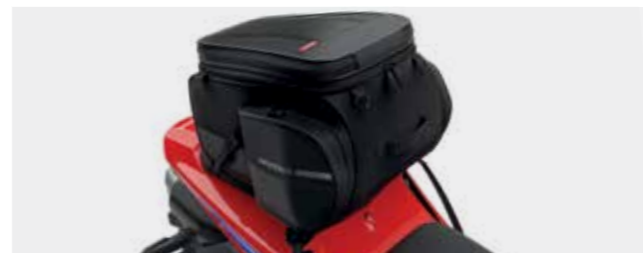
REAR SEAT BAG 08ESY-MKZ-RRSEAT

Functional rear bag specifically adapted to the tapered shape of the rear seat. Capacity of 15L that can be expanded to 22L. Easily attached and perfectly stable when installed with the specific attachment included.