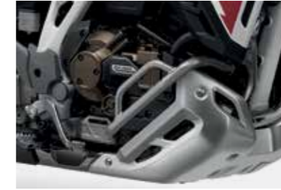
ENGINE GUARD WITH ATTACHMENT 08ESY-MKS-ENG

The Engine Guard improves the protection of the engine and the lower part of the bike. Made of stainless steel and finished with electrolytic polishing, it is resistant to corrosion and easy to clean. (attachment included)