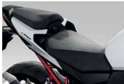
MAIN SEAT 08R74-MLB-D00ZA

The sportiness, sound and overall riding experience is enhanced with the slip-on muffler by SC-Project. Homologated for road use, includes a carbon fiber heel protector exclusively designed for the CB750 Hornet. This product is a customized part.