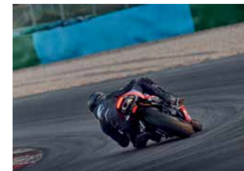
The CBR600RR in action.

Inline fours are the apex predators of the sportbike world. This is the kind of engine that our World Superbike and Supersport riders race. And if you've ever ridden a bike like our CBR600RR it's easy to see why. The engines are super-responsive and high revving. The handling is scalpel sharp. And our CBR600RR combines all that with the light weight of a 600-class machine—and light weight is the key to all sorts of performance benefits. A rare breed these days, fours like the CBR600RR are a delight for track-day use, and outstanding on twisty back roads.