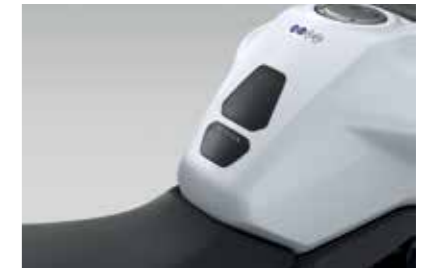
TANK PAD 08P70-MGC-J00

The skid pad, featuring the Honda logo, reduces damage of the fairing in case of a fall.