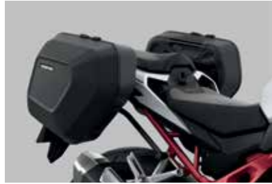
SIDE BAG 08ESY-MLB-SDB

Set of semi-rigid side bags (resin-made) Honda branded and specifically designed to suit the bike's shape, with waterproof inner bags and padlocks included. The bags have a 16.5L carrying capacity each and feature quick-release fasteners for easy attachment and detachment. Material / finishing: Textured Resin & Polyester, finished in Black. Maximum load capacity per panniers: 1.4 kg. Side Bags attachment included 08L74-MLB-D00.