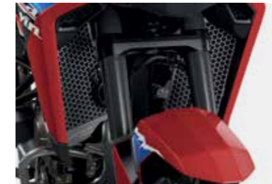
RADIATOR GRILLS 08F71-MKS-E00

Made of stainless steel and showcasing the CRF logo, the Radiator Grills increase the African Twin tough image. Their original mesh pattern combines cooling capabilities with protection for the radiators against flying debris.