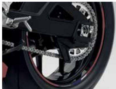
SPROCKET PROTECTOR 08P77-MKR-D10

Available in black, this set of left and right frame guards do not guarantee the protection of all motorcycle parts should the motorcycle fall over.